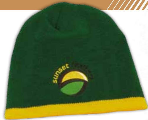
*Shown in Forest/Gold Stitch Count: 10,162

See pages 68-69 for more information on pricing