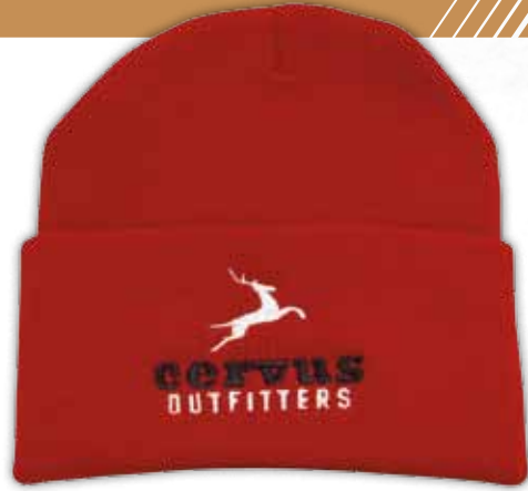
*Shown with embroidery Stitch Count: 3,840

See pages 68-69 for more information on pricing