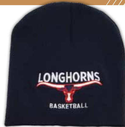
*Shown with embroidery Stitch Count: 8,592

See pages 68-69 for more information on pricing